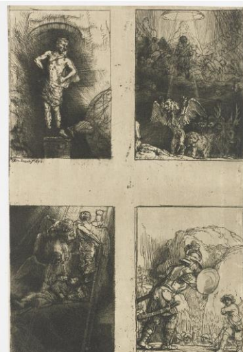
4. Rembrandt, Four illustrations for Menasseh's Piedra Gloriosa , 1655. Etching (uncut plate, state iii), 277 x 158 mm. Rijksmuseum, Amsterdam, inv. no. RP-P-OB-66

He then describes the four illustrated scenes in detail, adding that “ Todo esto ha costado, y aun algun trabajo y industria (All of this was costly, and [required] even some work and industry).” 19