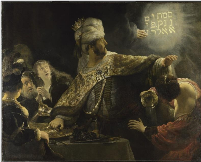
2. Rembrandt, Belshazzar's Feast , c. 1636–1639. Oil on canvas, 167.6 x 209.2 cm. National Gallery, London, obj. no. NG6350. Bought with contribution from The Art Fund, 1964

for the identification is perhaps shaky and doubt may well be justified.” 7 Thus, the jury is still out on this one.