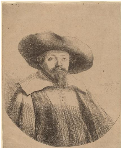
1. Rembrandt, Portrait of a Man , 1636. Etching, 149 x 103 mm, state iii (v). Museum het Rembrandthuis, inv. no. 185

It is a commonplace in the literature to claim that Rembrandt and Menasseh were not just neighbors, but friends and collaborators. 1 Menasseh was certainly not, as some have asserted, Rembrandt's "neighbor on the Breestraat" or living "in a house across the street." 2 However, the two men did live in the same neighborhood and not very far from each other. While Rembrandt was living on the Breestraat from 1632 to 1635, and then again—after brief residencies on the Doelenstraat between 1635 to 1637 and in the "Suikerbakkerij" on the Binnen-Amstel between 1637 to 1639—from 1639 to around 1658, Menasseh resided in (and ran his printing business from) a house on the "Nieuwe Houtmarkt," a vague designation for somewhere on the Vlooienburg island, which was just across the Houtgracht from the Breestraat. This was not a very large quarter of the city, and thus it easy to believe that such prominent individuals as Rembrandt and Menasseh knew each other (or at least knew of each other); no doubt they occasionally passed one another on the street. They also had some mutual acquaintances, including several members of the city's Portuguese-Jewish community. There is, for example, the physician Ephraim Bueno, who sat for a small oil portrait by Rembrandt 3 that served as the modello for the etched portrait of Bueno that he also made (dated 1647); the wealthy Dr. Bueno was also a financial backer of Menasseh's printing business.