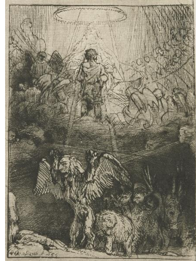
5. Rembrandt, Statue of Nebuchadnezzar , 1655. Etching, state v (v), 96 x 76 mm. Museum het Rembrandthuis, no. 22.001D