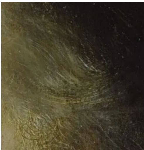
6. detail of fig. 4: hair.

It is perhaps not very surprising that this work went largely unrecognized at the sale, as there are no directly comparable painted portraits by Lievens from the same period. Instead the most relevant paintings are found among Lievens's tronies from the period, most significantly the Old Man in Schwerin (fig. 4), with its striking rendering of a full beard in layers of fine strokes in opaque paint, some of it dragged. 5 This striking technique employs physical texture, known as kenlijkheid , 6 to catch the eye and draws these lines forward, conjuring an open, nest-like structure for the beard. It provides a direct parallel to the handing of the hair at the side of the head in the Bader-Berrong painting (figs. 5, 6). The effect is enhanced by the use of black, grey, white and ochre for the various layers of depth. We already see a leadup in the colour play of cool greys and ochres in Lievens's signal and final masterpiece in Leiden, the Job on the Dungheap of 1631, now in Ottawa,