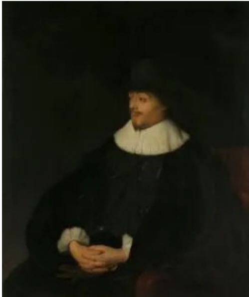
2. Jan Lievens, Portrait of Constantijn Huygens, 1629. Panel, 99 x 84 cm. Rijksmuseum, Amsterdam (SK-C-1467), on loan from the Musée de la Chartreuse, Douai, since 1962.