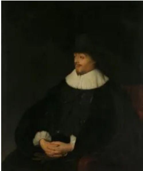
2. Jan Lievens, Portrait of Constantijn Huygens, 1629. Panel, 99 x 84 cm. Rijksmuseum, Amsterdam (SK-C-1467), on loan from the Musée de la Chartreuse, Douai, since 1962.

A comparably high social status is represented in the portrait now on loan to the Rembrandt House Museum. The sitter gazes slightly upwards, and seems to set his sights on higher aspirations, probably more worldly than spiritual, as Lievens did. A similar, slightly elevated gaze occurs in Lievens' portrait of Huygens (fig. 2) and subsequently in several tronies, in which the artist also experimented with a grand effect. 26 It reflected his image of himself as well. His confident attitude rubbed several people the wrong way, first of all Huygens himself, but also the Earl of Ancrum (c. 1579-1655), who wrote with clear irritation at Lievens's claim to be the best painter in all of Northern Europe. 27 Status mattered to Lievens, in ways it did not to his friend Rembrandt, who turned out one bourgeois portrait after another after arriving in Amsterdam. Around 1637, in Antwerp, Lievens evidently found his moment, and later in the Northern Netherlands he would indeed attract commissions, also for portraits, at the highest levels.