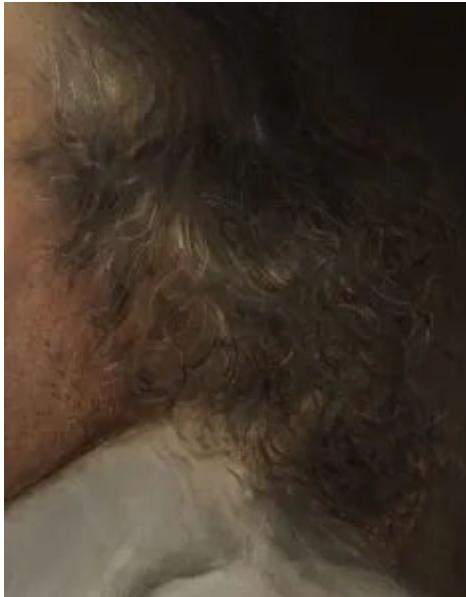
5. detail of fig. 1: hair.

It is perhaps not very surprising that this work went largely unrecognized at the sale, as there are no directly comparable painted portraits by Lievens from the same period. Instead the most relevant paintings are found among Lievens's tronies from the period, most significantly the Old Man in Schwerin (fig. 4), with its striking rendering of a full beard in layers of fine strokes in opaque paint, some of it dragged. 5 This striking technique employs physical texture, known as kenlijkheid , 6 to catch the eye and draws these lines forward, conjuring an open, nest-like structure for the beard. It provides a direct parallel to the handing of the hair at the side of the head in the Bader-Berrong painting (figs. 5, 6). The effect is enhanced by the use of black, grey, white and ochre for the various layers of depth. We already see a leadup in the colour play of cool greys and ochres in Lievens's signal and final masterpiece in Leiden, the Job on the Dungheap of 1631, now in Ottawa,