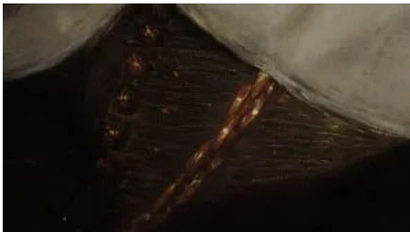
9. det. of fig. 1: brocade textile of the jerkin.

The date and place of a portrait often find reflection in the fashion represented. The most prominent element in the Bader-Berrong portrait is the broad, flat collar. It is largely the same as worn in several portraits drawn by Lievens in Antwerp around 1636/37, including that of Jan Davidsz. de Heem (fig. 7), and of Adriaen Brouwer (1603-1638). 12 It is quite different from the lace collars that dominate elite male portraiture in Amsterdam and London in the second half of the 1630s. When Lievens portrayed Constantijn Huygens in a drawing on a visit to Leiden in 1639, it was, by contrast, in a lace collar. 13 Yet it appears to have been a general preference for portrait representations in each location, and that behind the scenes, in real life, lace and flat collars were both worn in both locations. Marieke de Winkel speculates that the preference for flat collars in Antwerp portraits may even have been dictated by painters who saw the surface of the flat collar as better suited to the fluid lines and undulating surfaces characterizing local painting fashion in general and who may have been disinclined to labour over the details of lace. 14