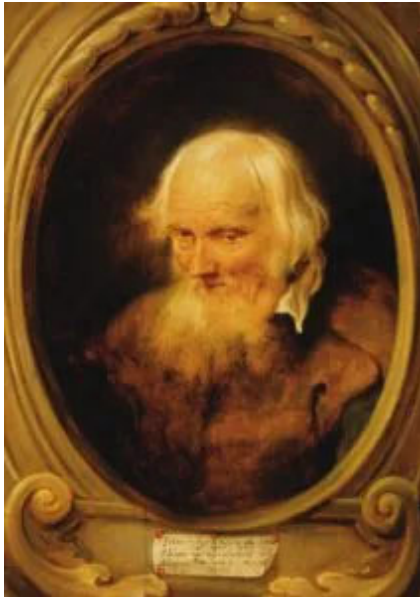
11. Jan Lievens, Portrait of Petrus Egidius de Morrion, 1637. Panel, 83.5 x 59 cm. Budapest, Museum of Fine Arts (4311).

Commissions for painted portraits appear to have represented a threshold Lievens found difficult to cross in his first ventures outside the United Provinces. Only one example from the Antwerp period (1634-1644) was previously known, and it is notable for its eccentricity (fig. 11). Egidius Petrus de Morrion is shown peering through an illusionistic carved frame, bearing an illusionistic piece of paper identifying the sitter and claiming an astonishing age of 112 years. The cartouche is completed with the artist's signature and a date of 1637. Strangely, we know nothing else about De Morrion. The Latinized first and second names (for Gillis and Pieter or Peter) strongly suggest a scholarly profile, and the man's sharp gaze and smile evoke intellect and wit. It could be that he was portrayed for reasons other than his extreme age. But the portrait does not project high social or political status, and thus falls short of the court patronage ambitions that drew Lievens to London and Antwerp.