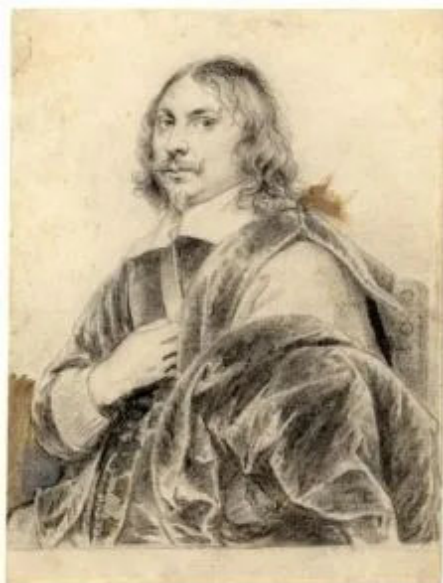
7. Jan Lievens, Portrait of Jan Davidsz. de Heem , c. 1636. Black chalk with grey-brown body colour. London, British Museum

At the same time, the impact of Anthony van Dyck's portraiture studied in London and Antwerp also reveals itself. The gently undulating surface and fluid, sweeping contours of the collar and edges of folds of the jerkin depart from the stiff solidity of the Leiden years, witnessed in the Huygens portrait. We see this development already in Lievens's drawn portrait of his friend and fellow artist in Antwerp, the still life specialist Jan Davidsz. de Heem (1606-1684: fig. 7). 9 In his Head of an Old Man in New Orleans, which bears a monogram and date of 1640, Lievens appears to have gone even further in adopting Van Dyck's manner (fig. 8). 10 He has moved further away from the flamboyant textural effects of his Leiden years, and towards a smoother idealization of the figure. Even accounting for possible wear, the beard and hair no longer show the prickly, toothy effect of the webs of thin opaque dragged strokes in the Schwerin and Bader-Berrong paintings; these can therefore be placed earlier. The soft and atmospheric handling approximates another male tronie , in the Bader Collection in Kingston, which must also date around 1640. 11