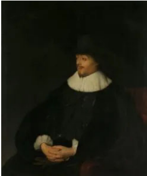
2. Jan Lievens, Portrait of Constantijn Huygens, 1629. Panel, 99 x 84 cm. Rijksmuseum, Amsterdam (SK-C-1467), on loan from the Musée de la Chartreuse, Douai, since 1962.

The kind of imposing presentation in the Bader-Berrong painting was favoured by Lievens, as already observed by Huygens soon after he encountered the artist in a visit to Leiden in 1628. 16 Wearing the shoes of the liefhebber , or art lover, the secretary to the stadholder was exercising powers of observation and analysis in the well-known passage of his autobiography contrasting Lievens's inclinations with Rembrandt's talent for conjuring grand emotions even in small figures. His characterization of Lievens was later echoed in the inscription on the print after Anthony van Dyck's portrait of the artist: " Pictor Humanarum Figurarem Maiorum " (Painter of Grand Human Figures). 17