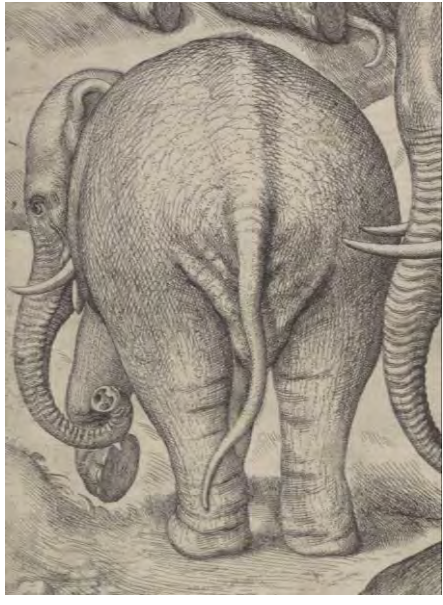
5 – detail of fig. 4

To the left Emanuel appears from behind; in the same pose and direction as in the French drawing and with a tusk (fig. 5). Although the dimensions of the elephant in the drawing digress somewhat from the printed one, and details vary somewhat from the etched elephant – the trunk has a simplified form and the tail hangs slightly differently – it is very likely that this figure served as model for the draughtsman.