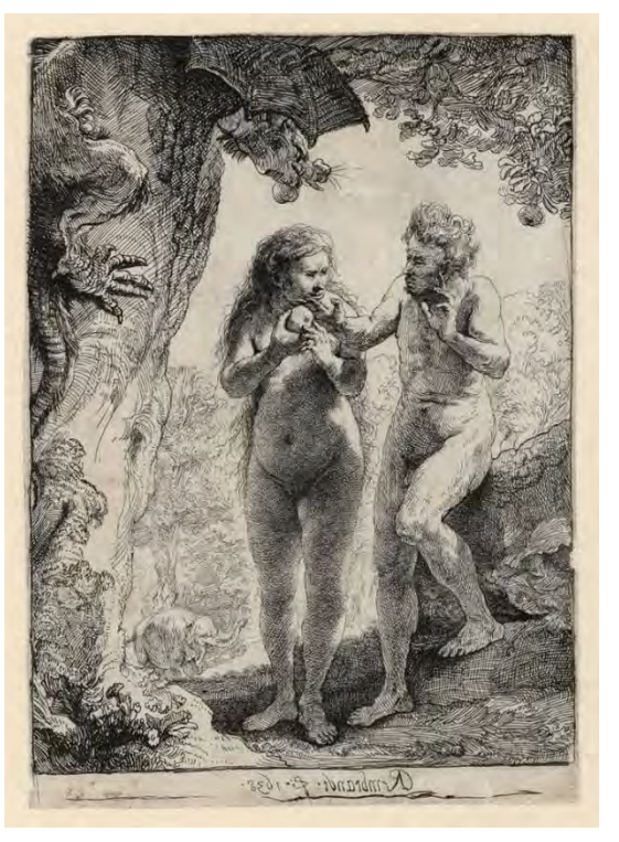
16 – Fig. 3, in mirror image, as Rembrandt would have drawn the image on the etching plate.