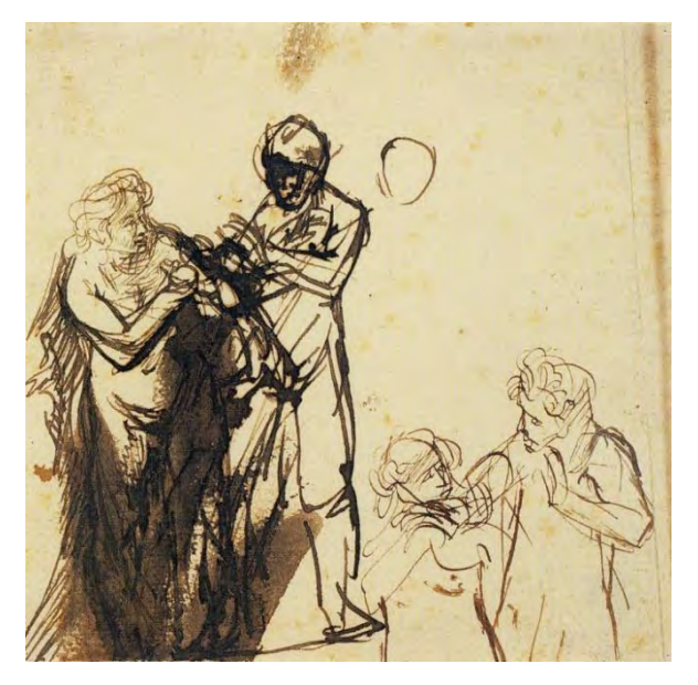
15 Rembrandt, Studies for Adam and Eve in Paradise , 1638. Pen and brush in ink, 115 x 115 mm. Leiden, University Libraries/ Prentenkabinet, inv. no. PK-P-103.149

For a fantastic beast such as a dragon Rembrandt leaned on the powers of imagination of his illustrious predecessor. But on his own Rembrandt sought out the correct poses and interaction of the two main figures (fig. 15 and 16).<sup>33</sup> Perhaps with the use of models, and thus "after life". Here he chose – against all conventions – to render Adam and Eve not with ideal beauty but as common, realistic people. The result of all of these forms of inspiration was a scene rich in significance, with many references to myths and stories, and a female elephant that had just previously been in Amsterdam.<sup>34</sup>