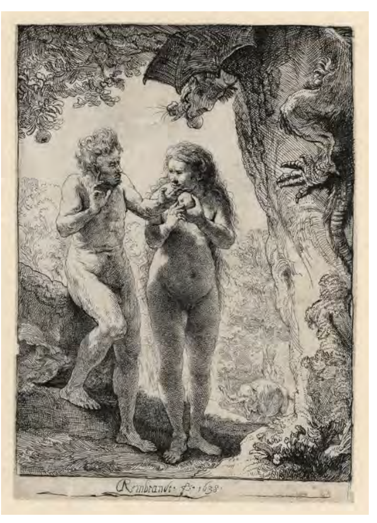
3 Rembrandt, Adam and Eve in Paradise , 1638. Etching, state 2 (2), 162 x 116 mm. Amsterdam, The Rembrandt House Museum, inv. no. 16

The earliest purchasers of this print will undoubtedly have drawn the link between the elephant in the background and the animal that just previously had been on view in Amsterdam.<sup>14</sup> In this way Rembrandt's print served as a visual reminder of a rare event. Rembrandt hereby, in a subtle way, joined an established tradition. Commemorative prints had namely been made of elephants that previously been in Europe.<sup>15</sup> One of these proves to be crucial to understanding the drawing of the elephant's buttocks.