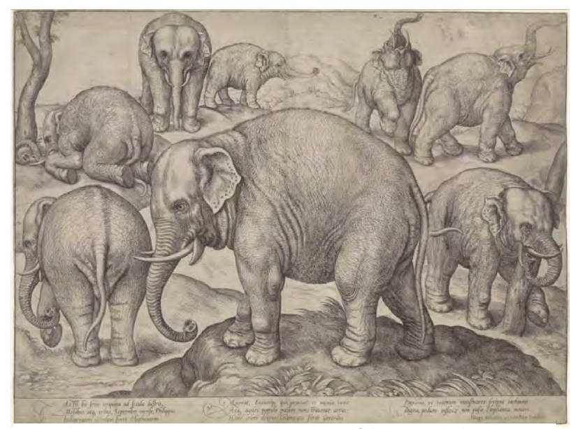
4 Gerard van Groeningen, Commemorative Print of the Asian Elephant Emanuel, in Eight Different Poses, 1563 or shortly thereafter. Etching, 405 x 541 mm. Amsterdam, Rijksmuseum, inv. no. RP-P-OB-59.019

On 24 September 1563 a live Asian elephant went on display in Antwerp. The animal was given the name Emanuel.<sup>16</sup> The etcher Gerard van Groeningen (Paludanus, active between c. 1561 and 1576) produced a commemorative print of the animal in that year or shortly thereafter (fig. 4).<sup>17</sup> There the elephant concerned is represented in eight different poses, set in a fantasy mountainous landscape.