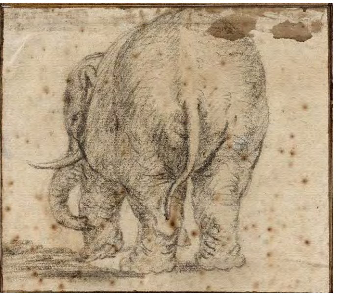
6 – fig. 2

The anonymous artist clearly worked from a printed, and not from a living model. In light of the similarities and differences with the print by Van Groeningen, the motif was freely – and thereby not very precisely – copied. Such a method fit with current practice: over the course of their working lives artists worked from prints and other works of art, as well as from life. In order to develop and maintain their drawing skill but also to research and practice with motifs.