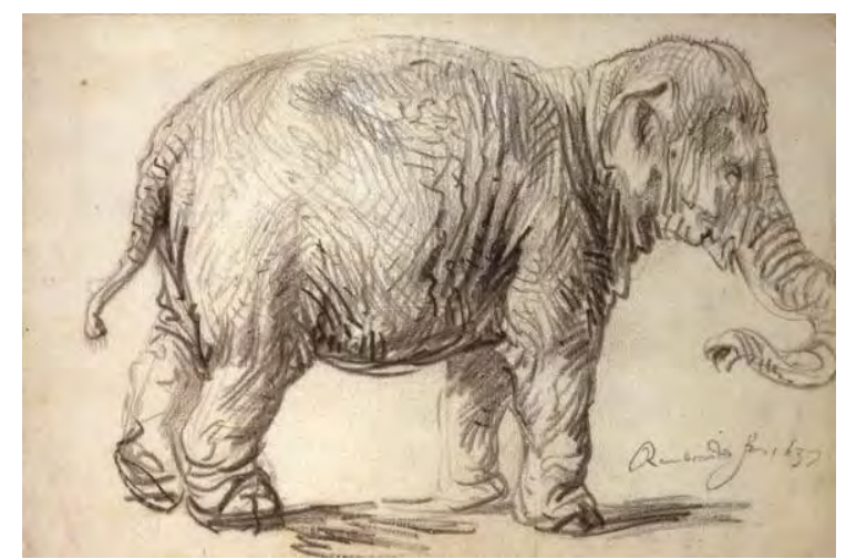
1 Rembrandt, Young Asian Elephant (Hansken) , 1637. Black chalk, 233 x 354 mm. Vienna, Albertina, inv. no. 17558

Hansken is the most famous elephant of the seventeenth century, partly thanks to Rembrandt, who drew her on several occasions. But there is much more material that gives insight into her life: prints, news reports, written sources, and even her skeleton.<sup>1</sup> In the summer of 2021 a selection of these objects went on view at the Rembrandt House Museum, in the exhibition Hansken , Rembrandt's Elephant . One recently discovered object that originally seemed to be related to Hansken did not make it into the final exhibition selection but merits a separate elucidation. It concerns a drawing of an elephant looking at its buttocks. Further research has shed new light on how this specific sheet was created. This article takes a closer look at the question.