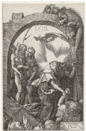
14 Albrecht Dürer, Christ in Limbo , 1512. Engraving, 116 x 75 mm. Amsterdam, Rijksmuseum, inv. no. RP-P-OB-1172

Rembrandt must have been aware not only of prints of elephants in circulation, but also ones of dragons. Between 9 and 13 February 1638, he purchased various prints by Albrecht Dürer from the collection of Gommer Spranger.<sup>31</sup> Christ in Limbo must have been among them (fig. 14).<sup>32</sup> There the devil appears in the guise